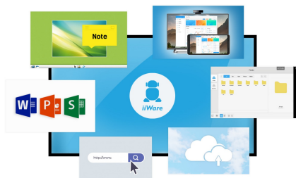
iiWare 8.0 (Android OS)

Share, stream and edit content from any device directly on screen and transform your team meetings or lessons into an easy, fast and seamless interactive session with the included WiFi module ( OWM001 ) and the ScreenSharePro app.