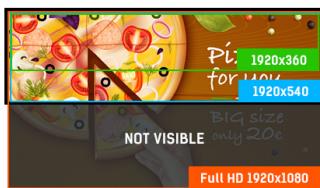
Full HD content

With a 24/7 operating time, landscape and portrait orientation and brightness of 1000cd/m 2 , this display can be installed anyhow and anywhere you want, ensuring an optimal fit and maximum exposure. The S3820HSB is fanless, only weighs 8.8 kg and comes with two handles for easy handling and installation.