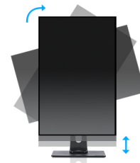
HAS + Pivot

A typical CCFL LCD uses four backlight lamps. Using LED diodes considerably lowers the power consumption and reduces the CO 2 emission into the environment making this LCD a true ECO-Friendly product.