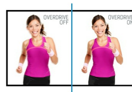
OverDrive ON / OFF

IPS displays are best known for wide viewing angles and natural, highly accurate colours. They are especially suited for colour-critical applications.