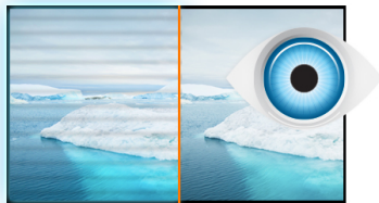
Flicker-free + Blue light

The ProLite B2083HSD is a 19,5" 1600x900 LED-backlit monitor with a Height Adjustable Stand supporting Screen Rotation, ensuring perfect posture and optimal viewing comfort. It features 5msec black-to-black response time and 12 000 000 : 1 Advanced Contrast Ratio assuring very good picture quality. The monitor is Energy Star Certified. A perfect solution for education, local government, business and finance markets.