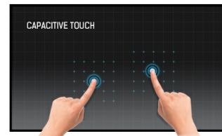
Touch technology - Capacitive

IPS displays are best known for wide viewing angles and natural, highly accurate colours. They are especially suited for colour-critical applications.