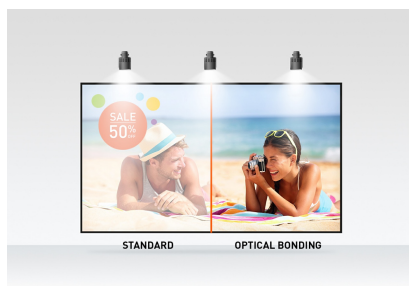
Optical bonded PCAP

The flexible stand can be positioned at several angles creating a comfortable and ergonomic user experience and the integrated cable management system hides all the cables and electrical wires giving a neat and cable-free workspace. The ProLite T2438MSC-B1 can be used in landscape, portrait and face-up orientation. A perfect solution for interactive signage, instore retail, POS and interactive presentations.