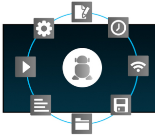
Android İşletim Sistemi

This ELED VA display consumes significantly less power compared to DLED IPS while maintaining the same level of brightness. Its versatile orientation, sleek design, and 24/7 reliability ensure it seamlessly integrates into any business environment. Whether it's used in retail, corporate, hospitality, or educational settings, the LH3260HS-B1AG will undoubtedly captivate your audience and leave a lasting impression.